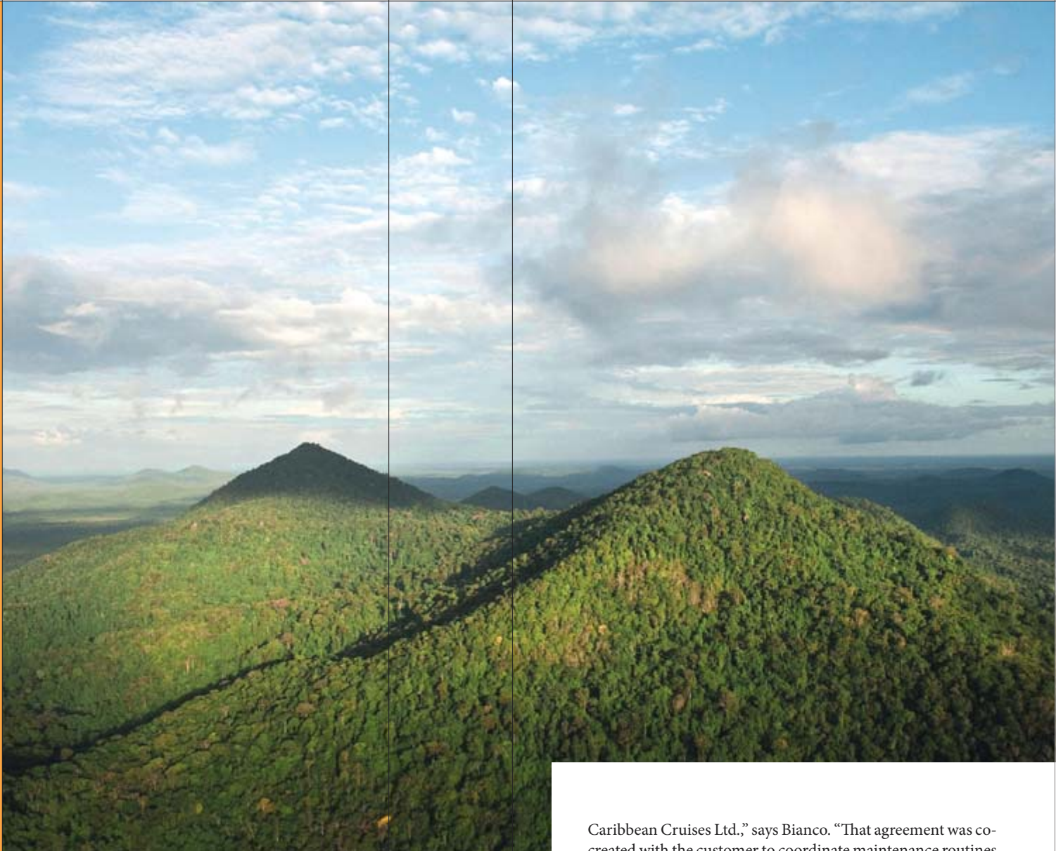
The Kanuku Mountains are, the pride of Guyana. [Above]