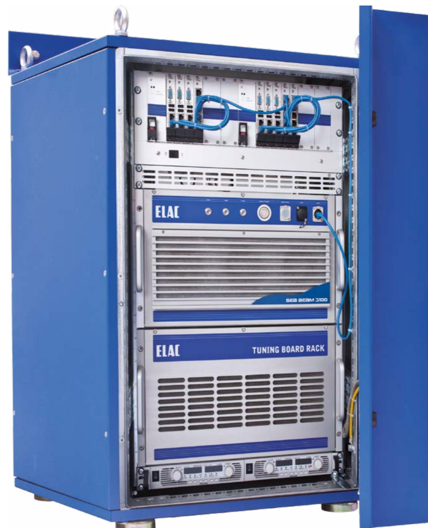
Wärtsilä ELAC SeaBeam 3030 – transceiver unit

Wärtsilä ELAC SeaBeam 3030 optionally provides a fully automatic FM mode, utilising frequency-modulated (FM) pulses.