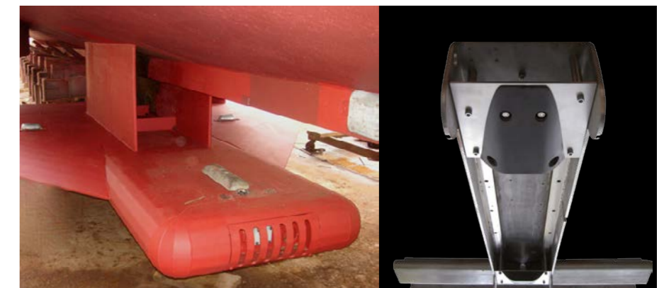
Gondola installation and mobile bracket

Wärtsilä ELAC SeaBeam 3030 provides bottom slope data via serial interface. These data are calculated via linear regression and are e.g. useful for the automatic steering of a sub-bottom profiler.