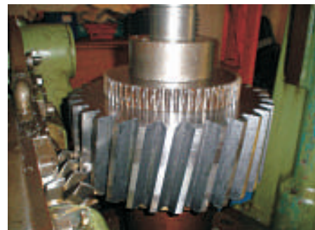
Driven gear teeth cutting

WÄRTSILÄ® is a registered trademark. Copyright © 2009 Wärtsilä Corporation