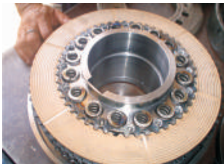
New clutch assembly with clutch plates