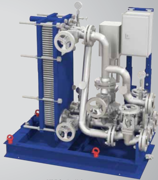
MDF Cooler Unit